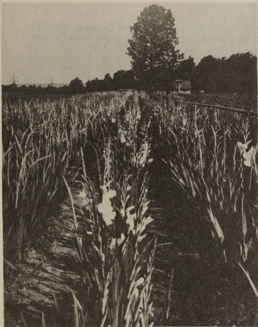
A portion of our early cut-flower planting.